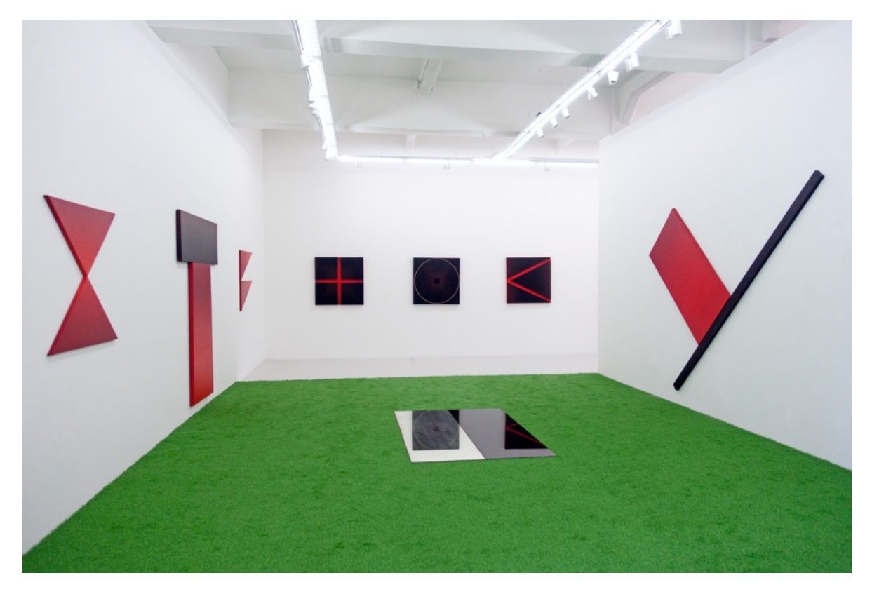
Installation view of Primeval Codes