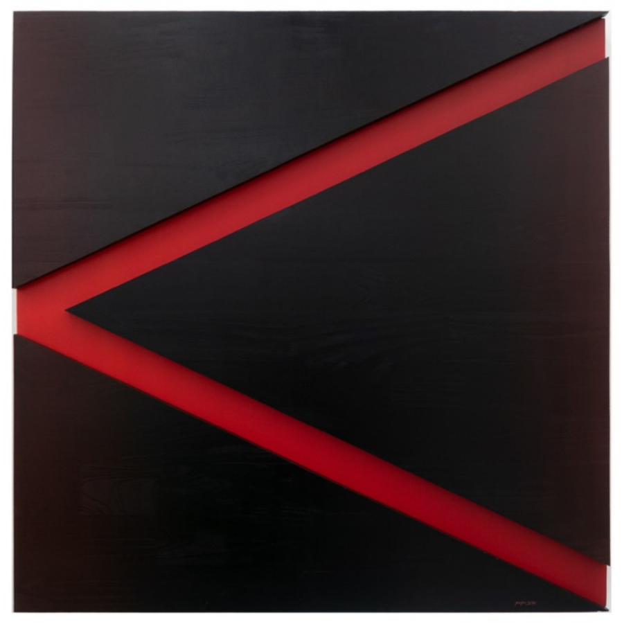
Warrior, 1988 / 2020, oil on canvas and mounted wood, 91 x 92 x 5 cm