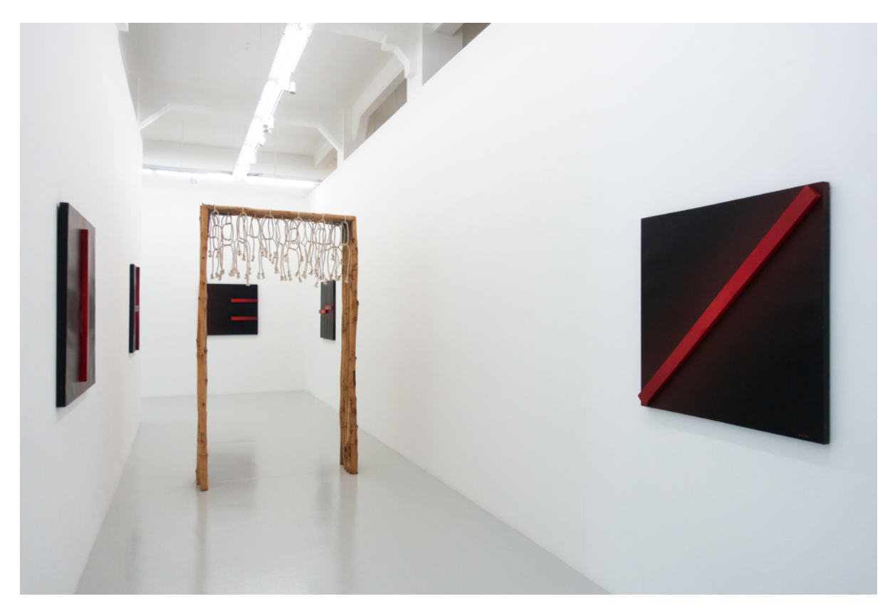
Installation view of Primeval Codes