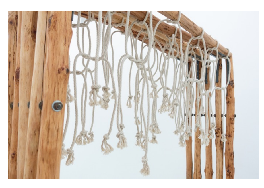
Detail of Aerial Message, 1993-97/2020, rope, wood, iron, dimensions variable