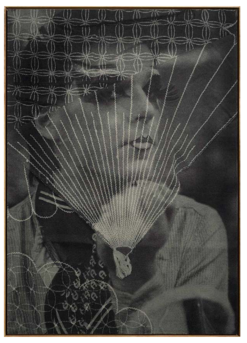
David Noonan, Untitled, 2015, silkscreen on linen collage, 206 x 146cm