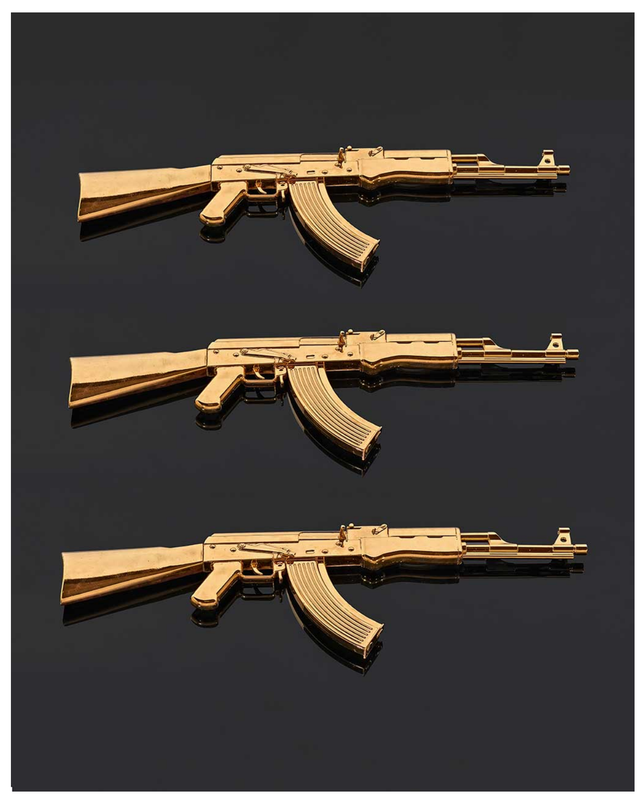
Penny Byrne, Weapons of Mass Destruction, 2015, porcelain with 24 carat gold gilding, 30 x 93 x 6cm (each)