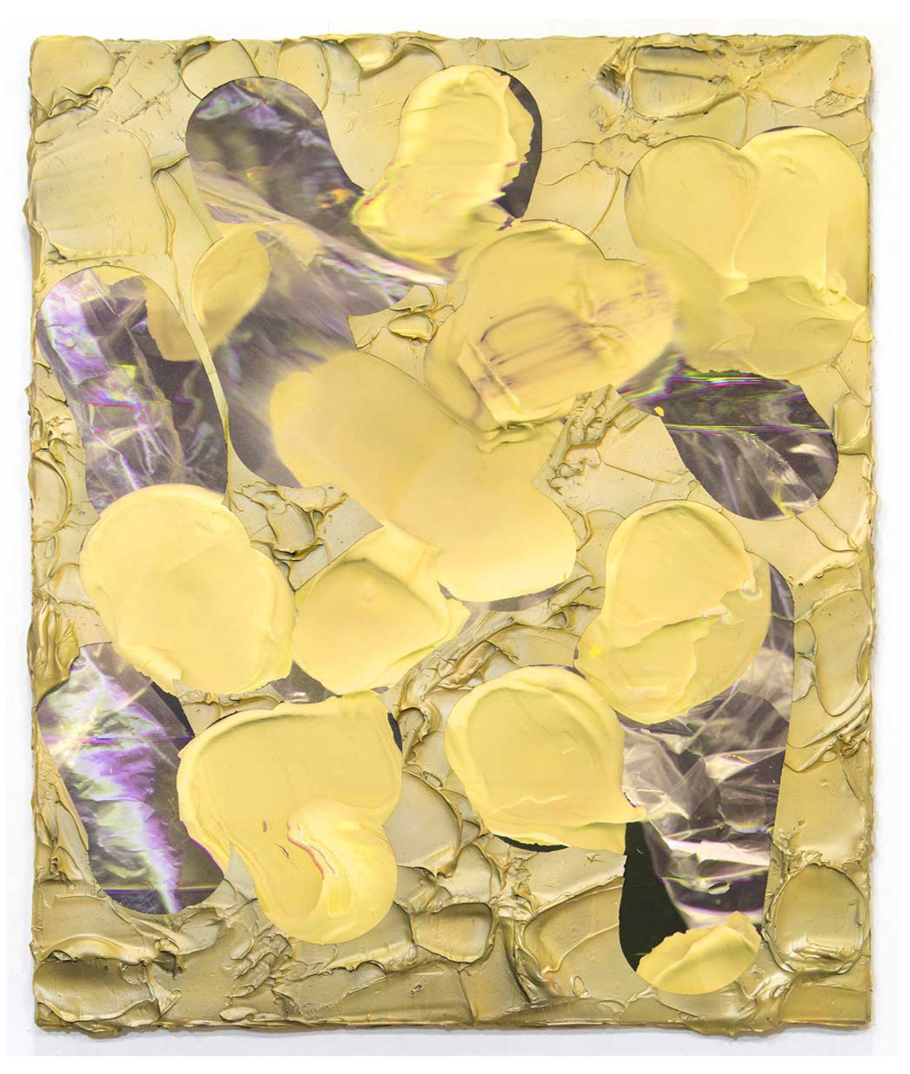
Andre Hemer, Big Node #27, 2015, acrylic and pigment on canvas, 120 x 90cm