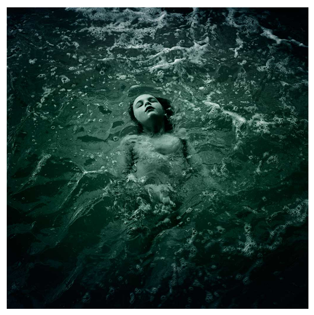
Tamara Dean, Emerge, 2015, photograph on archival fibre based on cotton rag, 150 x 150cm