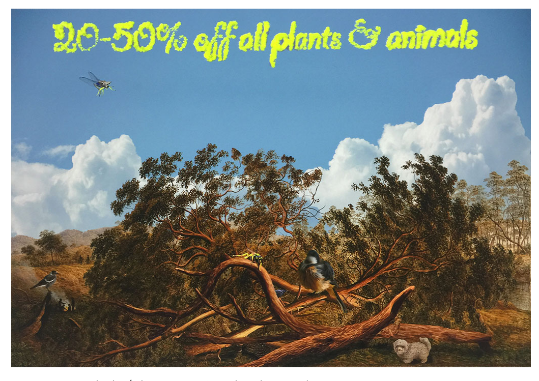
Joan Ross, Stocktake $ale! Now on!, 2015, hand painted pigment on cotton rag paper, 61 x 90cm