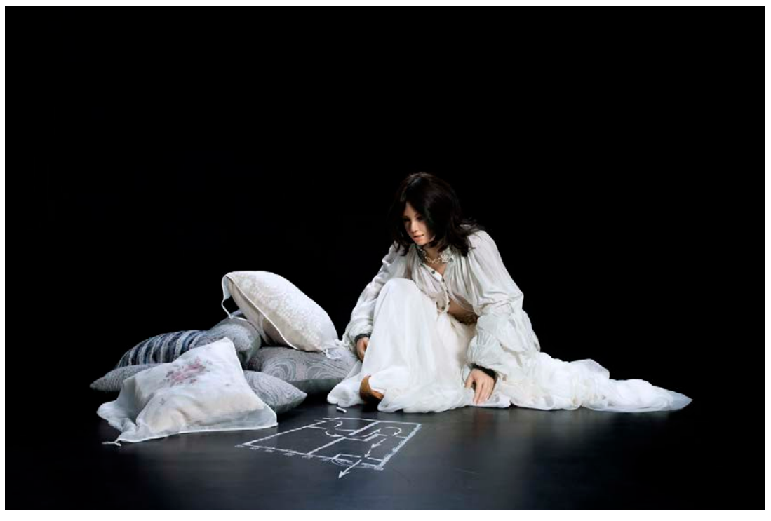
Konstanze "Escape Plan from the Seraglio", 2015, edition of 5 + 1 AP, C-print, 120 x 180cm