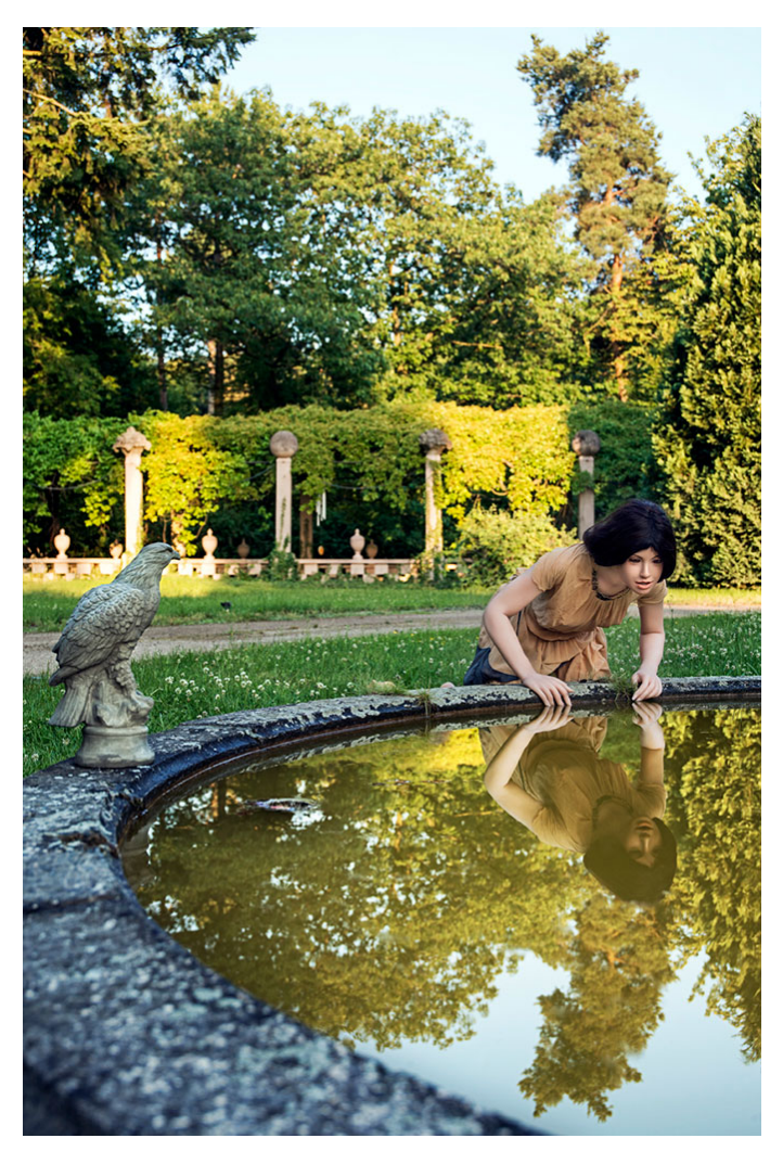
Estella "By Ourselves Again", 2015, edition of 5 + 1 AP, C-print, 180 x 120cm