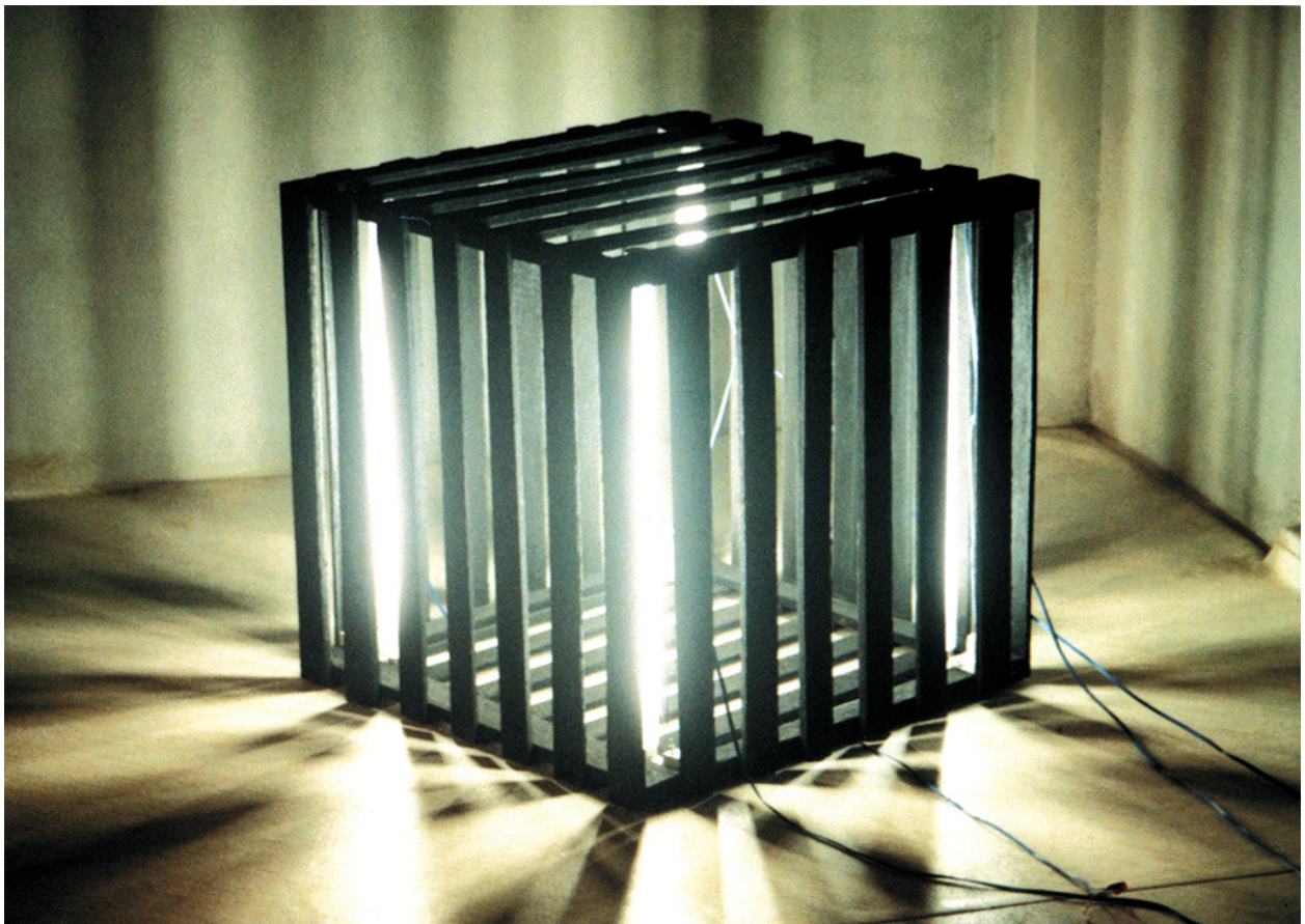
Controlled Tejo , 1991-96, wood, fluorescent lights, dimensions variable