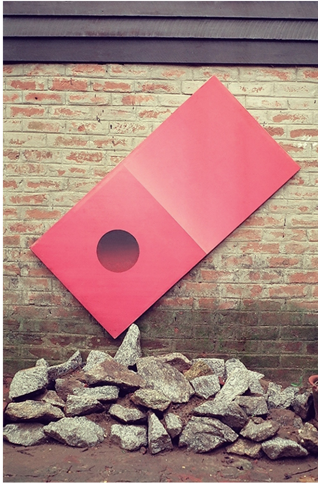
Red Cube (installation view), 1986, oil and paper collage on canvas, granite, dimensions variable