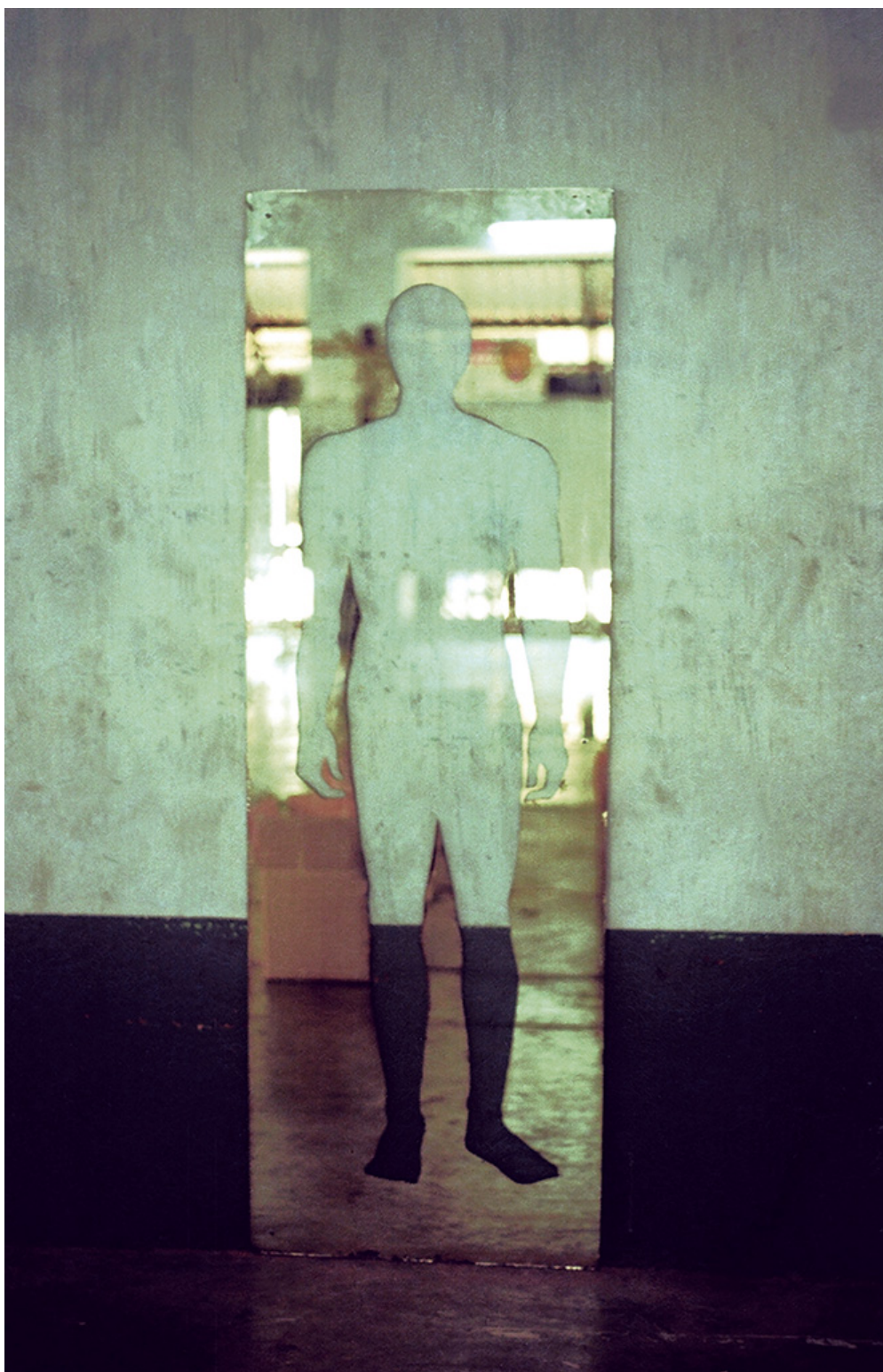
Incomplete Mirror #4, 1991-96, mirror, dimensions variable