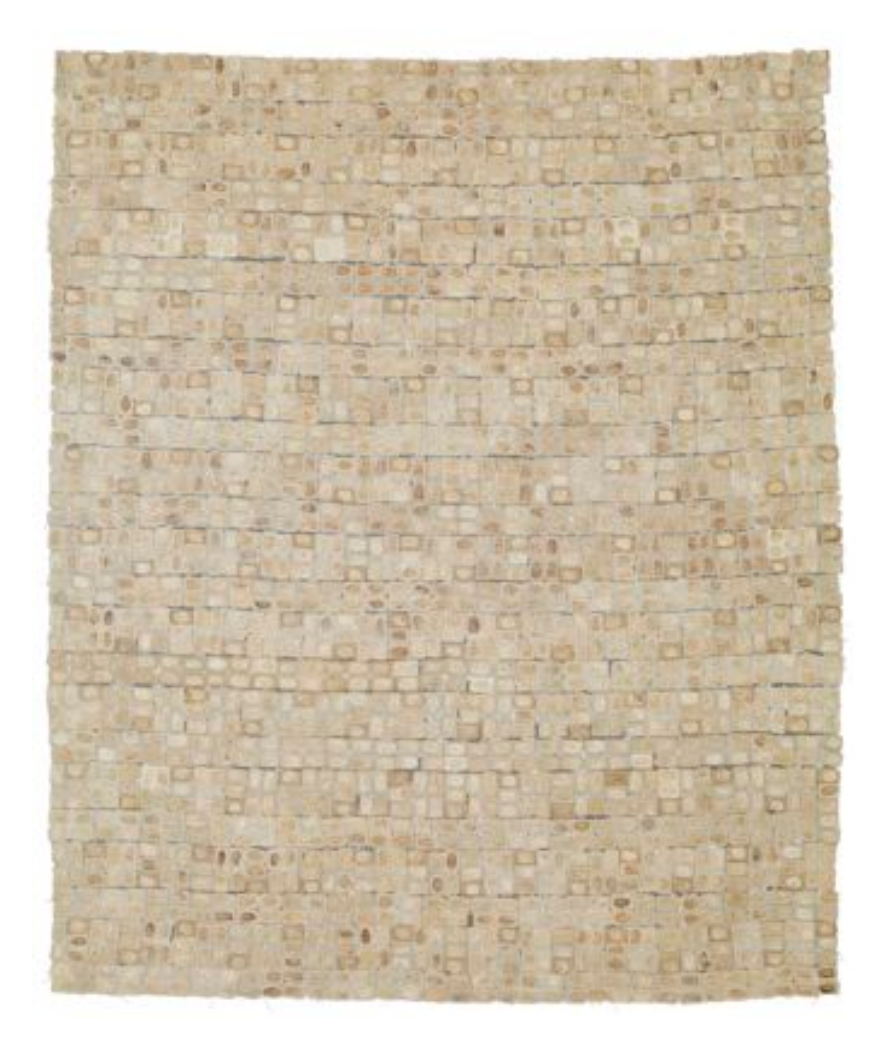
Pim Somdet I, 2014, crocheted amulets, 165 x 135cm