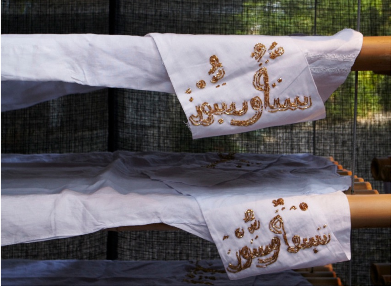
Embroidery details of 78