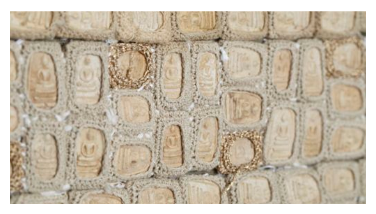
Detail of Pim Somdet I